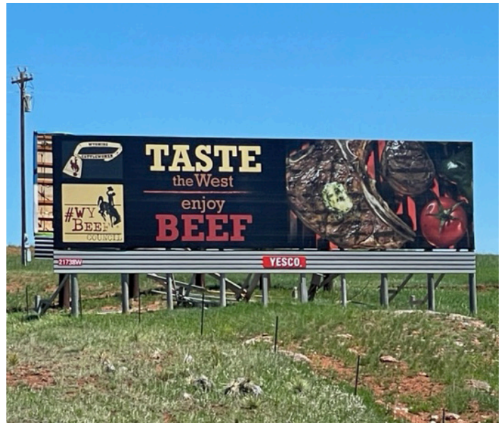
Billboards sponsored by Wyoming CattleWomen drew attention to the beef industry for summer tourists and travelers.