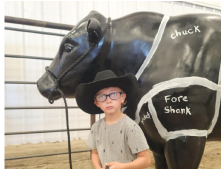
Fremont Valley's bull Buford taught about beef cuts in a life-sized way.